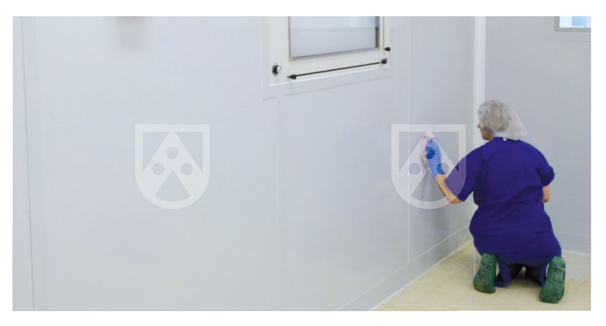
TroBloc® M hygienic wall panels have an easy-to-clean effect permitting the quick cleaning of even large surfaces.

The suitability of TroBloc® as hygienic wall panels is supplemented by treating the active side with silver ion technology, which impairs the reproduction of certain microbes such as bacteria or fungi on the surface. The effectiveness of this proven silver ion technology is based on an interaction of the silver ions with the proteins and the DNA of these microbes and has been confirmed by tests performed by an independent laboratory in accordance with the standards. In terms of the Biocidal Products Regulation, TroBloc® is a so-called "treated article".