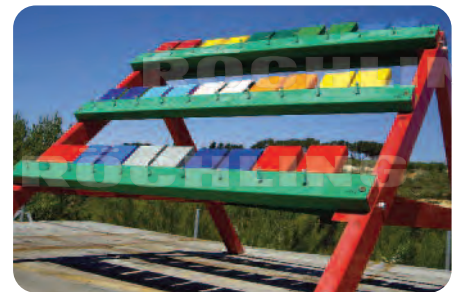
Outdoor weathering system with Play-Tec®

Due to the complexity and variety of the influencing factors of environmental conditions it isn't possible to translate the test results to real use, which is why Röchling has been collecting empirical data in outdoor weathering systems worldwide for many years.